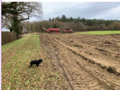
Lifting the sugar beet

As farmers, all we can really talk about this autumn is the wet!