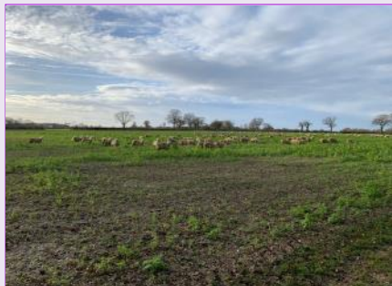
Sheep grazing a cover crop

It has been a joy to see the flocks of finches feeding on the wild bird mix patches on the farm and we are hoping to join an Upper Alde and Ore Cluster Group. The hope is that this will encourage support from industry and government for